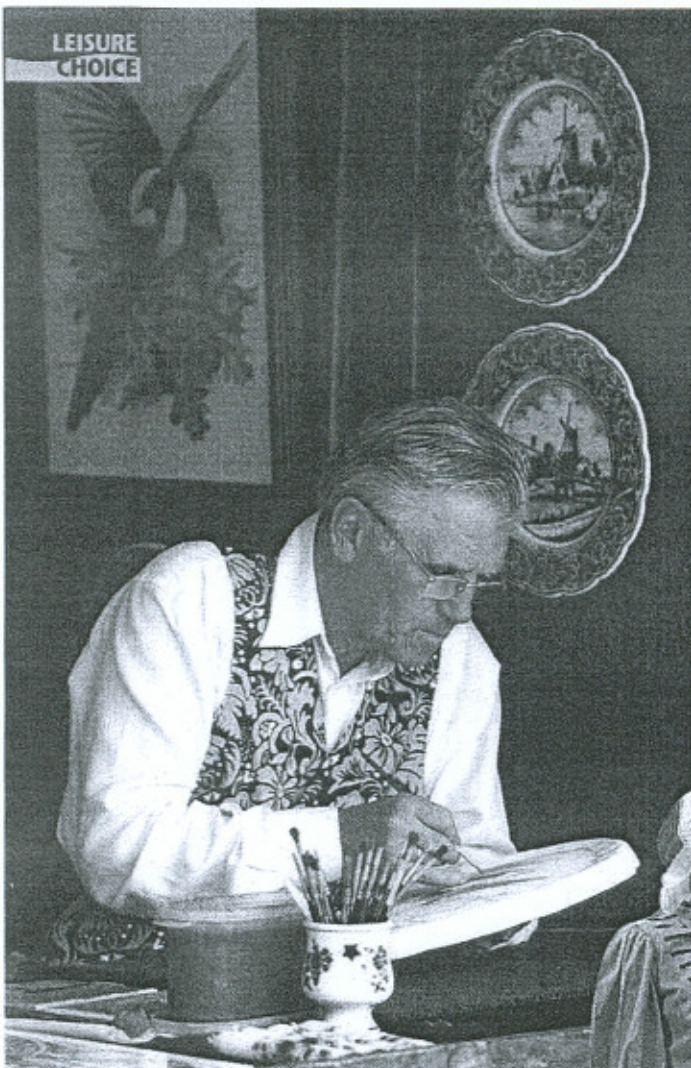
Delft Blue porcelain painter will demonstrate the craft